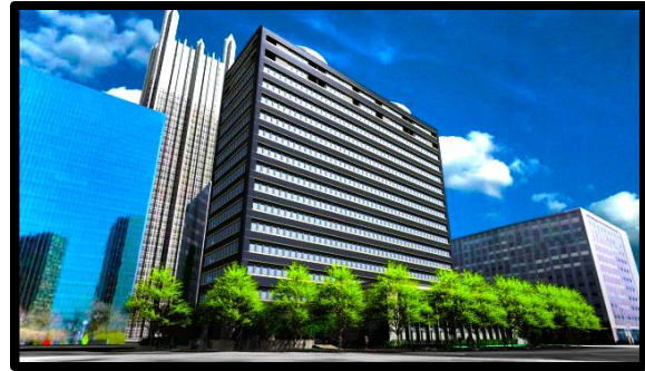
Figure 1 – Rendering Of River Vue Apartments Provided By IDG, LLP.

River Vue Apartments is the innovative reuse of the former Commonwealth of Pennsylvania State Office Building located in Pittsburgh, PA. Across from Point State Park in the Golden Triangle, these new luxury apartments will offer some of the best views of the city to its residents. The existing building was constructed in the 1950s and renovated in the 1980s, and through its simplicity and clarity of its form, it reflects a more modern architectural style. Modern materials such as metal and marble panels are a consistent theme throughout the architectural features of this building. Since the building project is mainly a 295,000 SF interior renovation, the new River Vue Apartments building, shown in Figure 1, will conserve these metal and marble panels. New bronze-clad window systems and existing metal-paneled columns will remain as key architectural features as well.